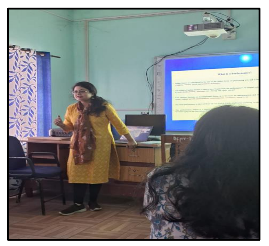
FACULTY FROM JIBANTALA COLLEGE TAKING CLASS AT DHUPGURI GIRLS' COLLEGE