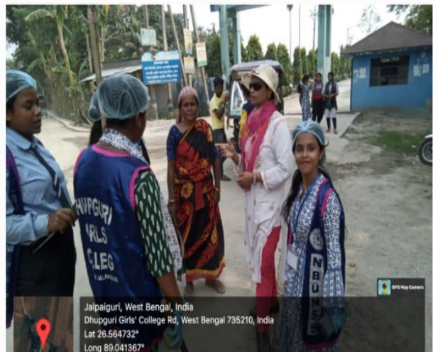
Jalpaiguri, West Bengal, India Dhupguri Girls' College Rd, West Bengal 735210, India Lat 26.564732° Long 89.041367°