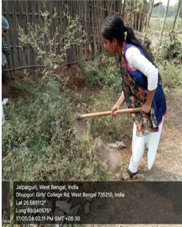
Jalpaiguri, West Bengal, India Dhupguri Girls' College Rd, West Bengal 735210, India Lat 26.565112° Long 89.040575° 17/05/24 02:11 PM GMT +05:30