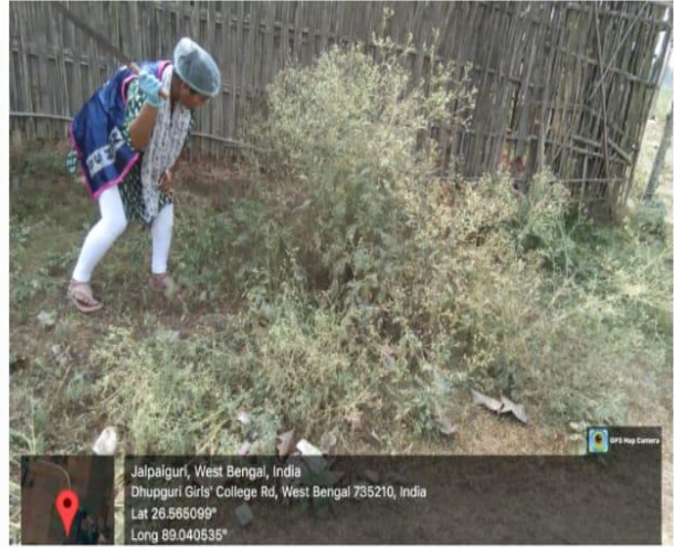
Jalpaiguri, West Bengal, India Dhupguri Girls' College Rd, West Bengal 735210, India Lat 26.565099° Long 89.040535°