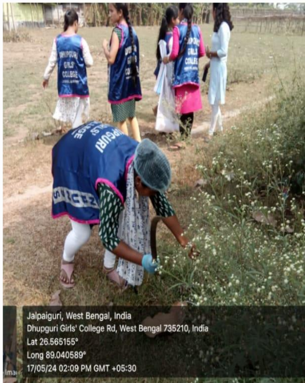
Jalpaiguri, West Bengal, India Dhupguri Girls' College Rd, West Bengal 735210, India Lat 26.565155° Long 89.040589° 17/05/24 02:09 PM GMT +05:30