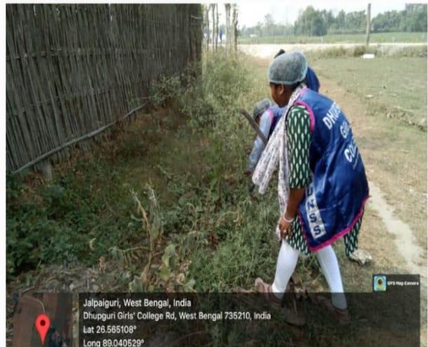
Jalpaiguri, West Bengal, India Dhupguri Girls' College Rd, West Bengal 735210, India Lat 26.565108° Long 89.040529°