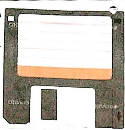
3 1/2 ଇଞ୍ଚ ବିକାଶ

ହୋଇପାରେ ବିକାଶର ପୂରଣ, ହାଲୁ, ଠାରୁ ଅଧିକ ଓ ଏହି ଠାରୁ ହୋଇପା- ରେ ଏହି କାର୍ଯ୍ୟକ୍ରମ ଓ ସହ